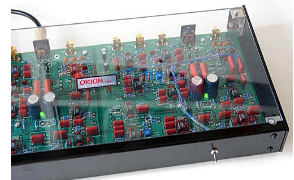
The ORION crossover / equalizer

The ORION employs two 24 dB/oct filters for highest accuracy of perceived sound.